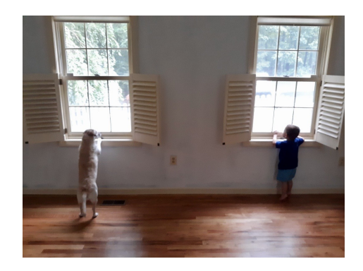
Isn't it time to go out and play ?