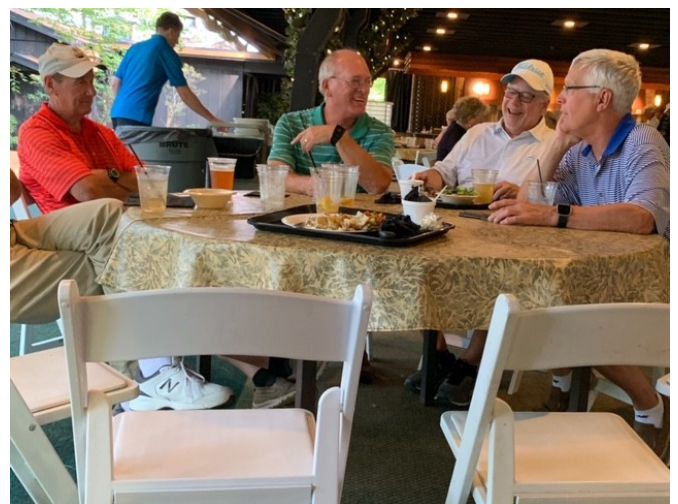
Time after dinner to sit and enjoy chatting with friends.