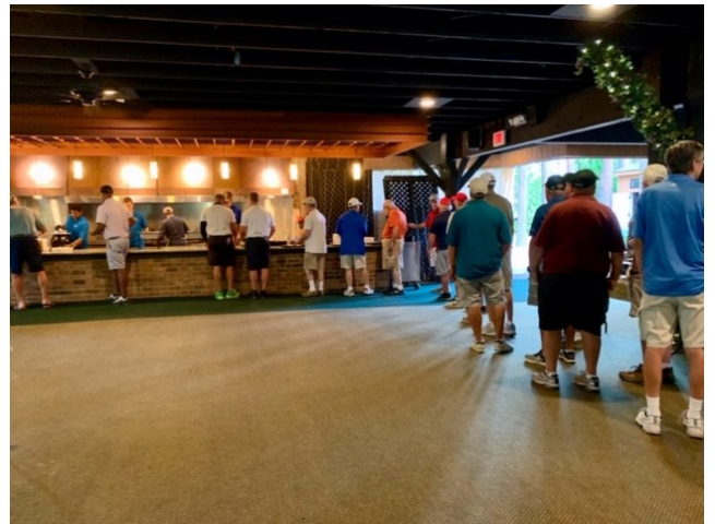
Everyone lines up for the delicious food as they worked up a good appetite.